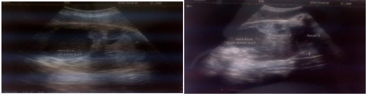
Fig. 1. Prenatal ultrasound: abdominl cystic mass