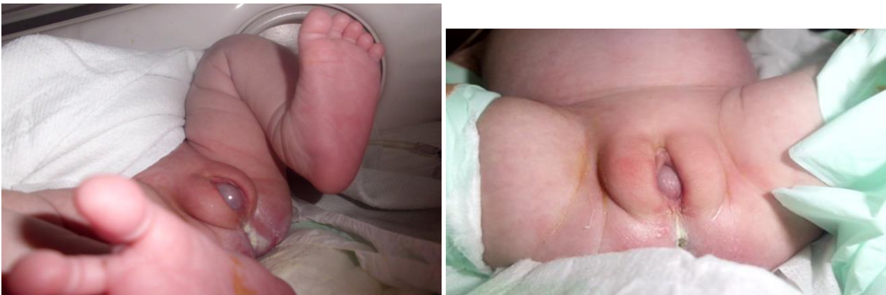
Fig. 2. Intralabial cystic mass